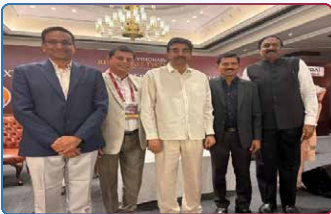
CREDAI EGB Meet

Ashiana One44 introduced high-rise luxury featuring rooftop wellness zones, pool-facing cafés, and duplex configurations. The logistics of the tour included stays at Ashiana Tree House Hotel and Hilton Jaipur, with local transport and meals coordinated. Through this tour, CREDAI AP delegates gained valuable insights into integrated township development, senior living models, and smart infrastructure execution.