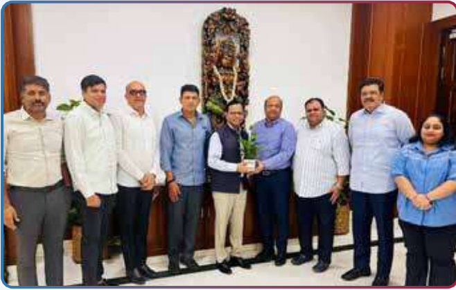
Meeting with Chief Secretary, Government of Telangana