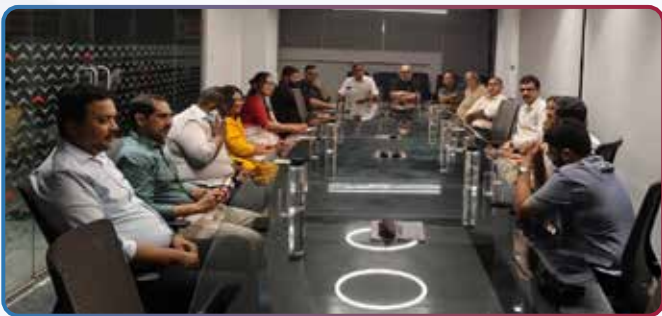
CREDAI Kochi hosted an Inter-Association Meeting

A total of 22 members participated, showcasing their projects across 45 stalls, alongside four financial institutions – HDFC, SBI, SIB, and Union Bank.