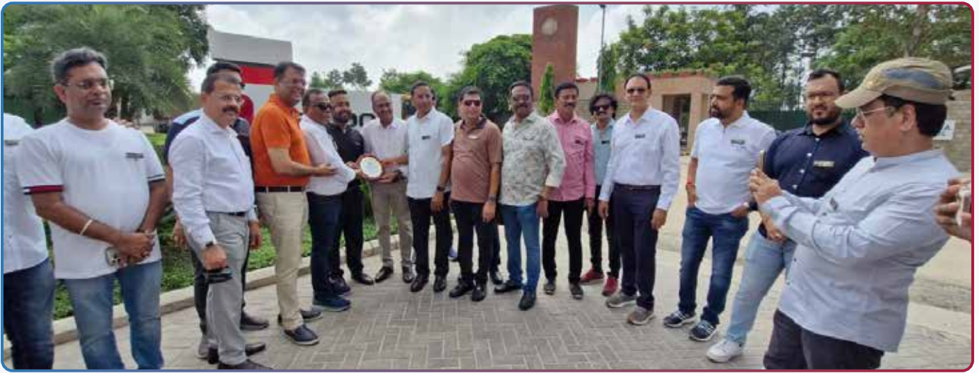
CREDAI Andhra Pradesh Participated in Rajasthan Study Tour

CREDAI Andhra Pradesh office bearers participated in the Emerging City Study Tour in Rajasthan, which focused on industrial innovation and urban luxury development. The tour included a visit to the Jaquar manufacturing unit in Bhiwadi, showcasing high-precision faucet production at 125,000 units per day with a ₹300 crore investment under the Make in India initiative. Delegates also inspected Dorset Industries in Binola, highlighting advanced architectural hardware and security solutions manufacturing. At the Ashiana Utsav Senior Living campus, they interacted with experts to understand “active ageing” design with daily engagement modules.