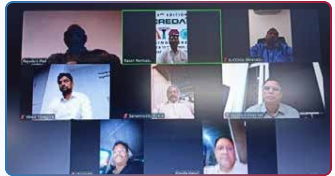
CREDAI Andhra Pradesh– third executive committee meeting

These efforts reflect CREDAI AP's proactive role in shaping equitable urban policy and streamlining real estate development across Andhra Pradesh.