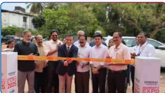
CREDAI Thrissur Property Expo