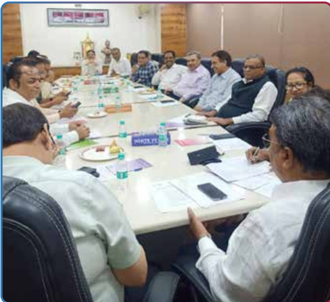
2nd Managing Committee Meeting of Raigad

As a part of charitable activities, the CREDAI MCHI Raigad has started Tree Plantation Drive on 18th August 25 in association with Panvel Municipal Corporation by planting more than 100 trees in Vichumbe, New Panvel by the hands of Shri Prashantji Thakur, MLA, Panvel and Dy. Commissioner, Panvel Municipal Corporation and targeted to complete minimum 1000 tree plantation in the coming few days