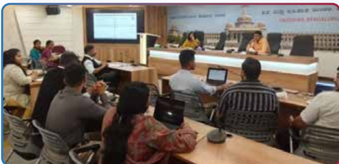
Meeting with the Karnataka Labour Department