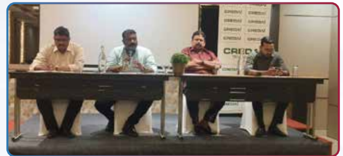
Executive Committee & General Body Meeting