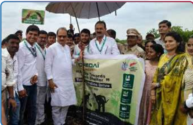
Tree Plantation Drive

The CREDAI-Maharashtra Women's Wing organized a Study Tour at Baramati on 2nd August, providing members with valuable insights into best practices, knowledge sharing, and collaborative learning.