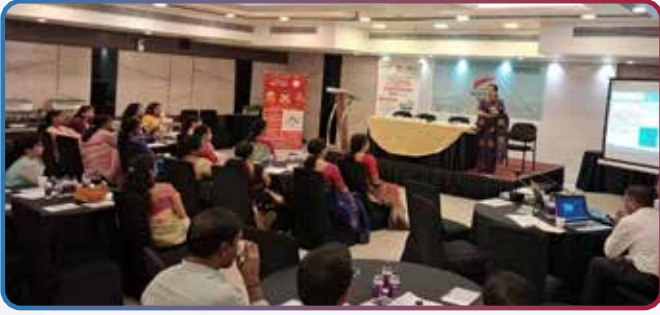
CREDAI Andhra Pradesh women's wing inaugural meet & technical session