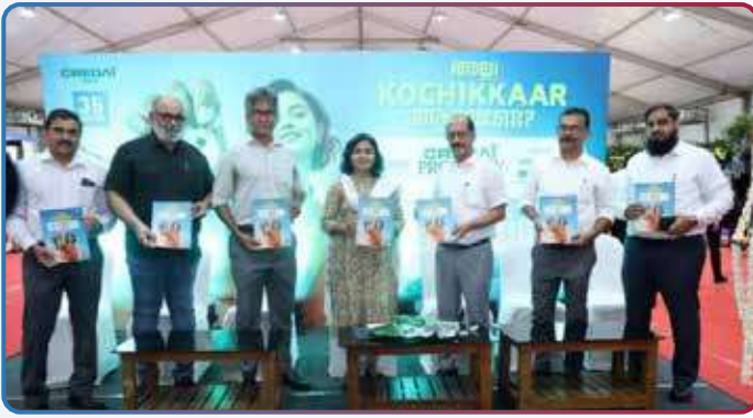
CREDAI Kochi Property Show