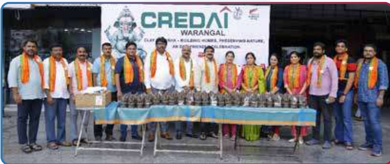
CREDAI Warangal Promotes Eco-Friendly Ganeshotsav with Clay Idol Distribution

In summary, CREDAI Hyderabad sought the Chief Secretary's intervention to issue policy-level directives that would enable ease of doing business, revenue enhancement for the state, and greater stability for the real estate sector.