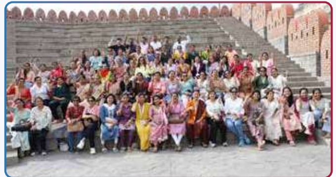
Study Tour of CREDAI-Maharashtra Women's Wing at Baramati