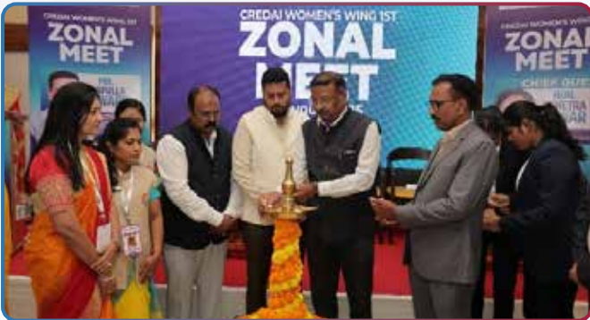
CREDAI Maharashtra Women's Wing 1st Zonal Meet