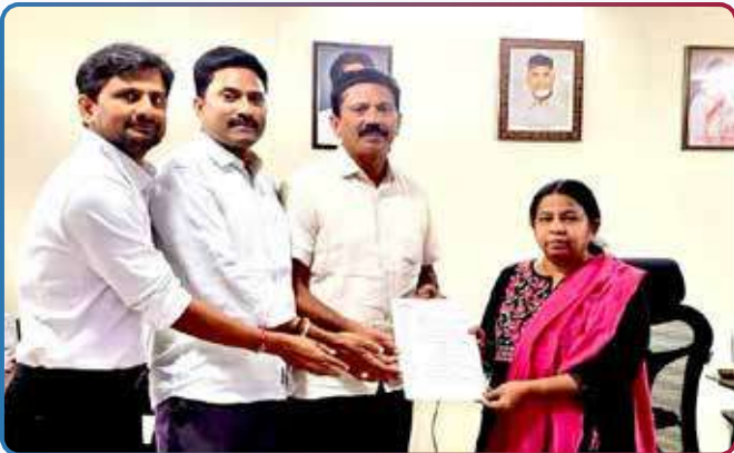
CREDAI Andhra Pradesh – consolidated representation & strategic engagements