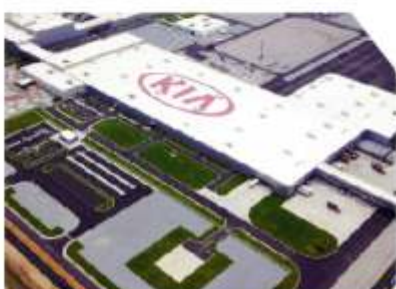
KIA Motors Andhra Pradesh