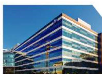
Kalyani Park Bengaluru