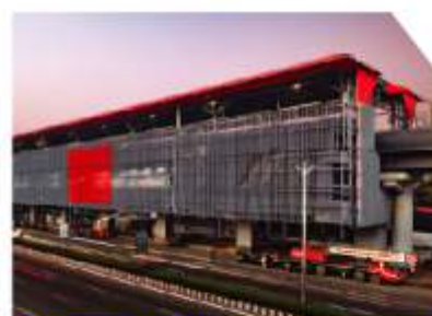
Mumbai Metro Mumbai