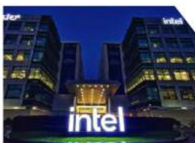
Intel Headquarters Bengaluru