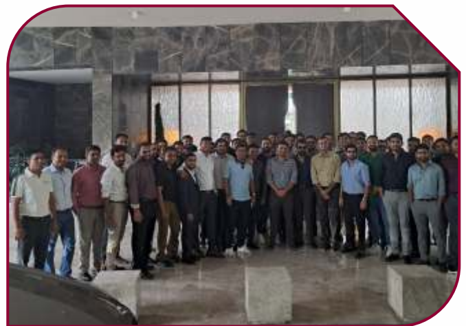
Study Tour for the members of Youth Wing

CREDAI NCR also thanked Team DLF for their exceptional support in making this event memorable and enriching. This successful study tour exemplifies the power of collaboration and the vital role of knowledge sharing within the CREDAI network.