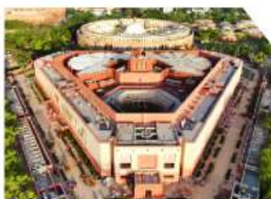
New Parliament Delhi