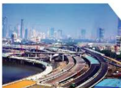
Coastal Road Mumbai

Pidilite has played important roles across some of the largest and most esteemed national projects through a wide array of solutions like adhesives, sealants, waterproofing, stone & tile adhesives, wood finishes and more.