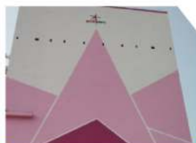
SHAR Shriharikota Andhra Pradesh