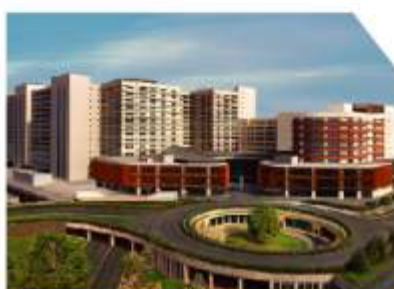
Amrita Hospital Faridabad