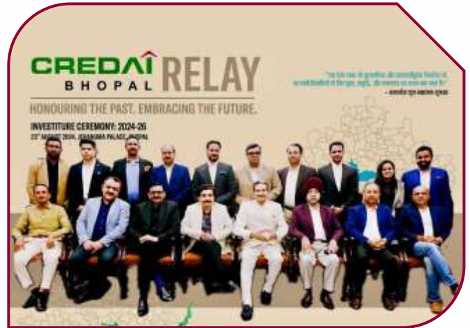
CREDAI Bhopal Election of Office Bearers for 2024-26